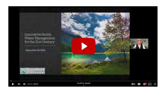
Watch this SWAW workshop that highlights phytoremediation.

have. A lot of space is required for this treatment option to be effective. If you have limited space but want to dedicate some of it to this treatment option, that's great! But know it will only be one of several options you are going to need to implement. Plus, there are some pollutants which may not be filtered out completely. Whether it's a vegetated swale, a water treatment marsh, or LID rain gardens, space is going to be the main downside of this option. You're going to need space, and a lot of it, for this treatment option to be effective.